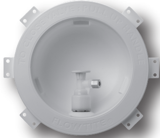
Valve Only Model (OBPO5-2, VBPO5-2, XBPO5-2)