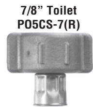
7/8" Toilet P05CS-7(R)