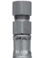
3/8" Faucet P05LS-3(CR)