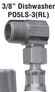
3/8" Dishwasher P05LS-3(RL)