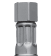
1/4" Ice Maker P05IS-2(R)