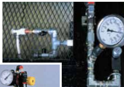
Daily hydrostatic testing (shows 1400psi-actual pressure).

The focus of our production team is to provide the highest quality control that affords ACCOR Technology to offer its unique 10-year labor and material warranty.