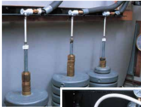
Hot water pull (180°F under direct load).

The design criteria for all ACCOR®s products have a high margin of safety well beyond the standards, backed with the strongest warranty in the business. ACCOR has been manufacturing its patented PUSHON ® technology in its Wenatchee, WA plant since 1988.